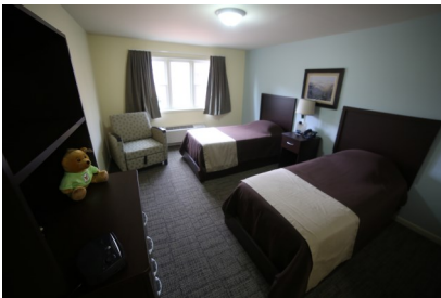
New rooms at the Ronald McDonald House

My next incorrect assumption was that everything is provided for by McDonald’s. I thought McDonald’s built and operated the facility. Not correct. The Ronald McDonald House operational model is more top down guidance and train-