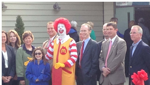
Grand reopening ceremony Tuesday, April 8th