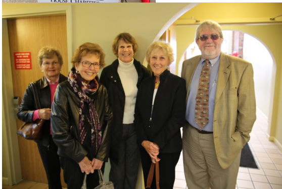
Ronald McDonald House life members